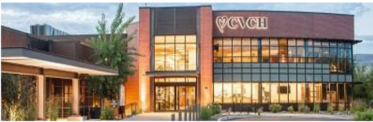
Columbia Valley Community Health (CVCH) Wenatchee: Medical, Dental, and Behavioral