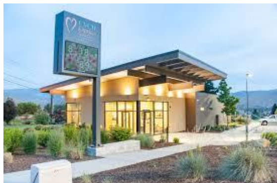
CVCH East Wenatchee: Medical and Express Care