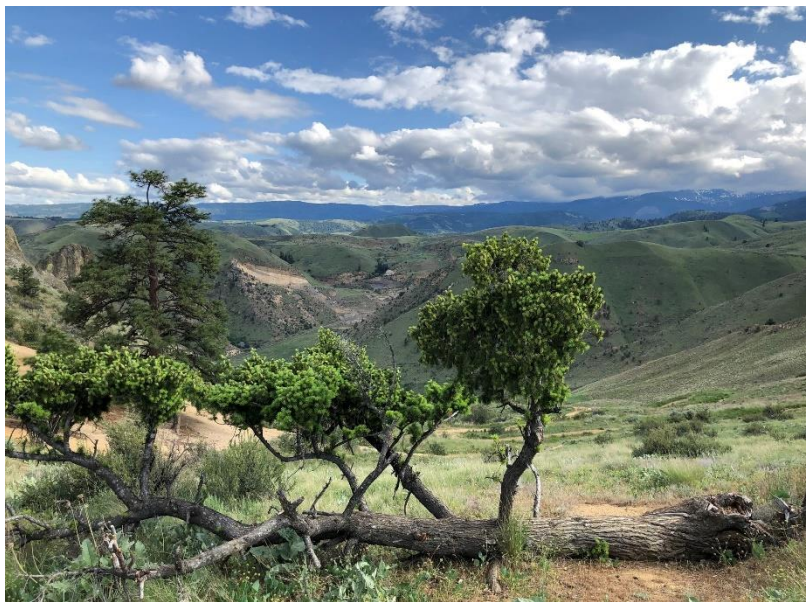
Saddle rock Trail in Wenatchee

To learn more about Wenatchee, please visit https://visitwenatchee.org/