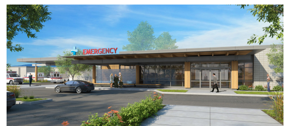
Art rendering of the new hospital set to open in 2021.

Lake Chelan Community Hospital is a fully-accredited 25-bed Critical Access Hospital in Chelan, Washington. They offer a 24-hour emergency room, inpatient services, obstetrics including surgical OB, and upper and lower endoscopy all staffed by experienced family physicians . The hospital also offers orthopedic surgery, gynecologic surgery, general surgery and podiatry. There is a 13-bed dual diagnosis inpatient treatment facility for patients struggling with addiction and mental health conditions with a full time psychiatrist and two psychologists. Rehabilitative therapy and behavioral care clinics are located at the hospital.