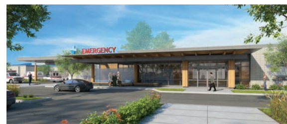
Art rendering of the new hospital set to open in 2020.

Lake Chelan Community Hospital is a fully-accredited 25-bed Critical Access Hospital in Chelan, Washington. They offer a 24-hour emergency room, inpatient services, obstetrics including surgical OB, and upper and lower endoscopy all staffed by experienced family physicians . The hospital also offers orthopedic surgery, gynecologic surgery, general surgery and podiatry. There is a 13-bed dual diagnosis inpatient treatment facility for patients struggling with addiction and mental health conditions with a full time psychiatrist and two psychologists. Rehabilitative therapy and behavioral care clinics are located at the hospital.